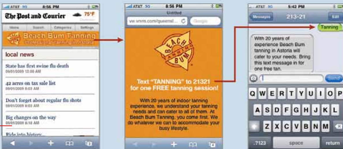
SMS: User texts a keyword to a short code, and the advertiser sends an SMS reply.