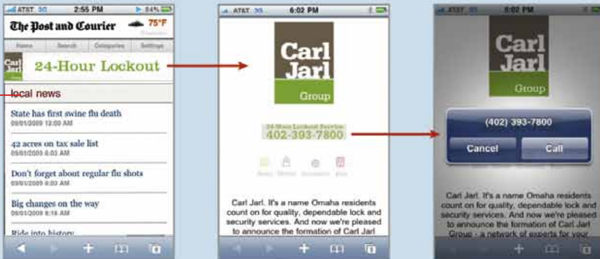
Click to Call: User can make direct phone call from landing page.