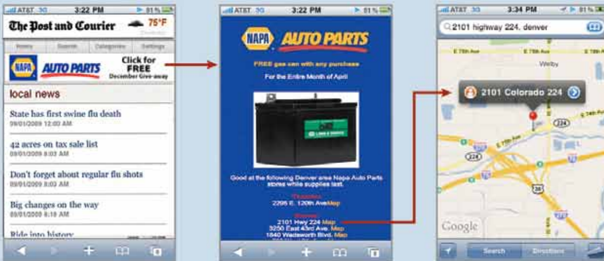
Click to Map: Phones mapping capability drives customers to your business' location.